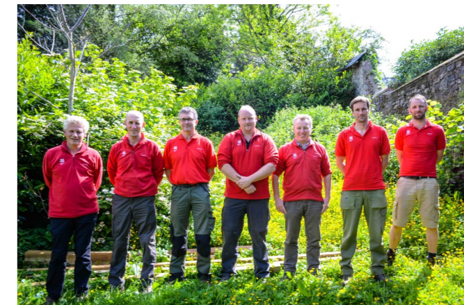
Rangers go red

We recently heard from the Heritage Lottery Fund that our Stage 1 application for funding for Fingle Woods with the Woodland Trust had been successful. We are now working hard to produce a Conservation Plan and an Activity Plan for the woods. Wildlife survey work is underway and as I write our in house Biological Survey Team are on site all this week. Some interim trails are up and we have erected a number of directional signs made from trees felled by the winter storms.